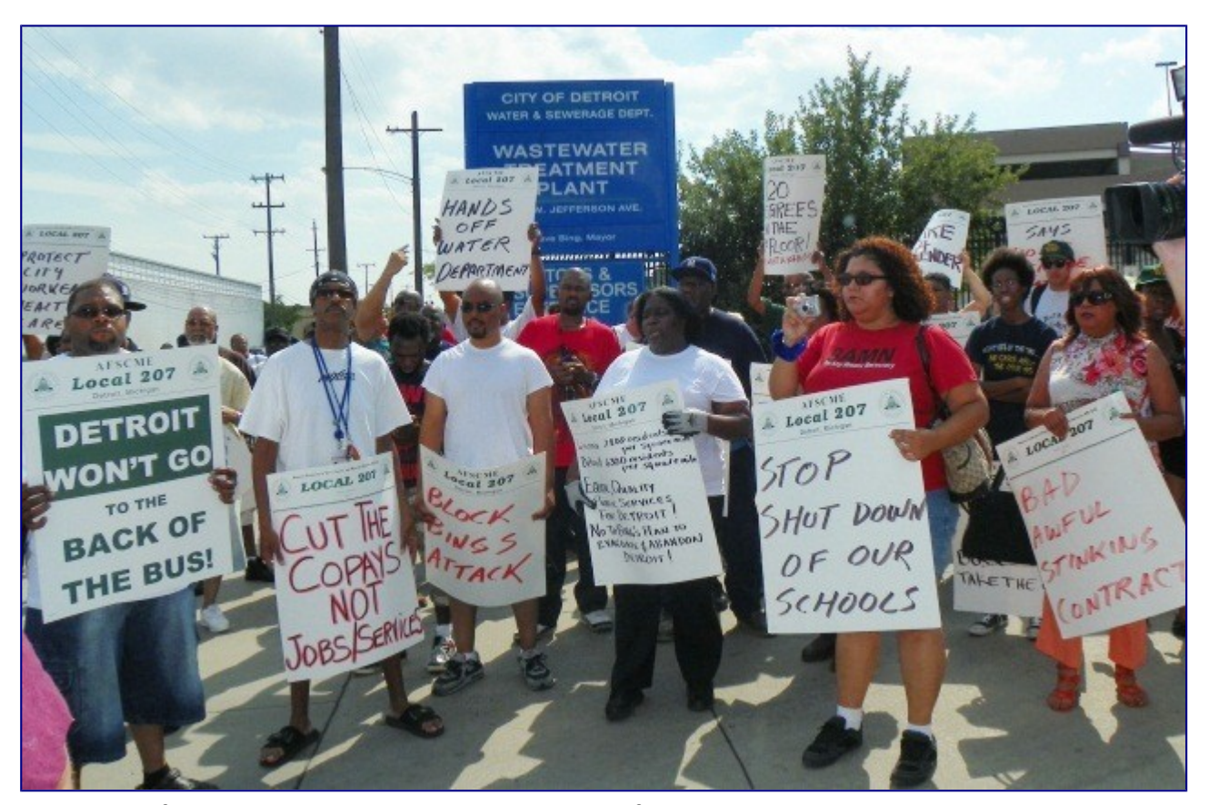
Part of a large crowd who rallied at the gates of the Wastewater Treatment Plant in Detroit July 24 to demand Detroit control of DWSD, a good contract for workers.

Over 150 pack protest at WWTP in support of city-wide strike, Detroit control of DWSD